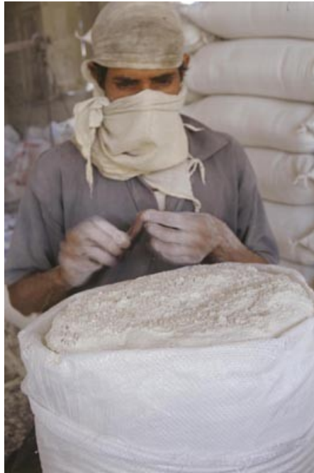
An Indian worker with a bag of asbestos at a milling unit in Udaipur, Rajasthan. Health officials say many such workers are poorly protected from the lung-ravaging fibers.