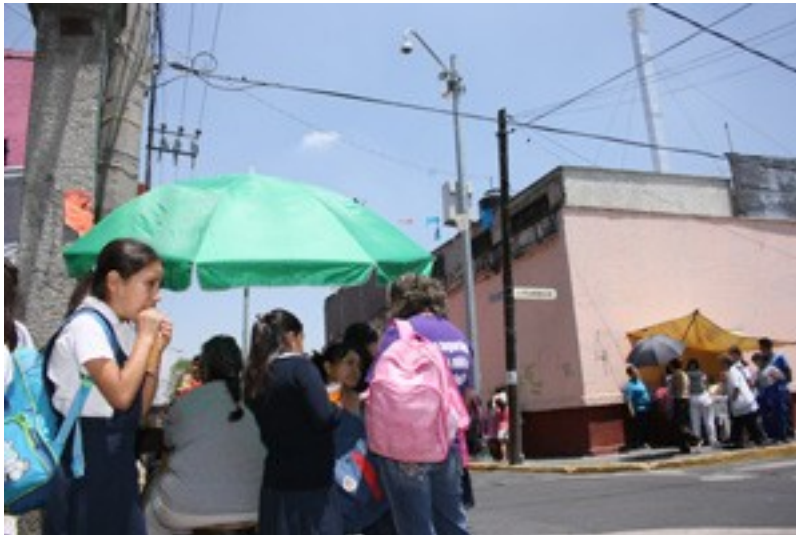
Children gather at a food cart across the street from the American Roll asbestos brake factory (right). Residents of the Mexico City suburb of Iztapalapa have complained repeatedly about emissions from the plant but say they've gotten little help from regulators.