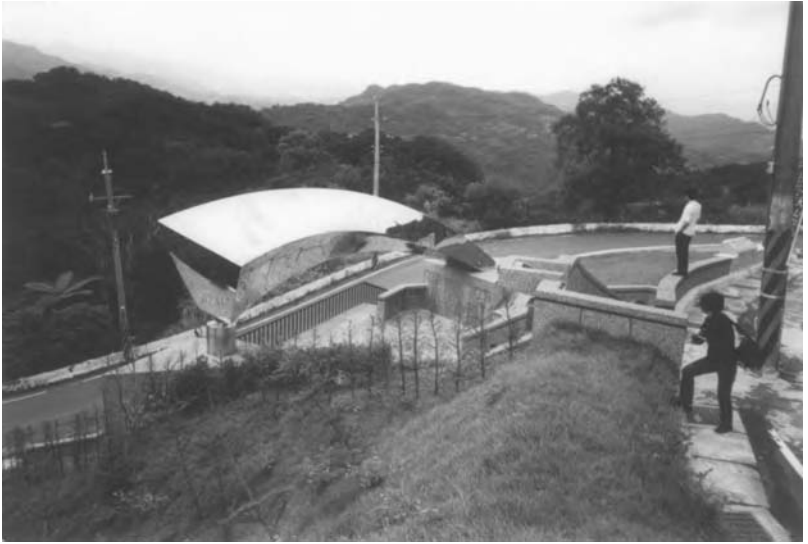
The Luku Incident Memorial October 2001

the basis of informants' intelligence without any evidence being brought forward'. 'The result was countless wronged souls [of those killed] and suffering in prison. Families were broken, suffering torments of grief.' The last paragraph then states the purpose of the monument. It is 'not only to commemorate those who died unjustly but to learn the lesson from their arbitrary arrest and sentences that human rights were crushed and that we should today join hands to make Taiwan a democracy and a society in which rule of law and fair justice prevail'. It expresses a similar aspiration to the practical utopia that Professor Lin Tsung-yi persuaded President Lee Teng-hui to endorse.