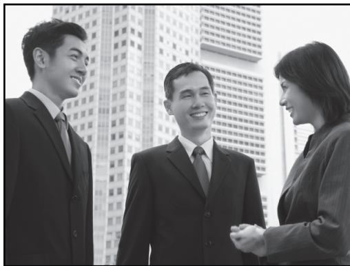
Cultures differ in the amount of emphasis they place on the individual versus the group.