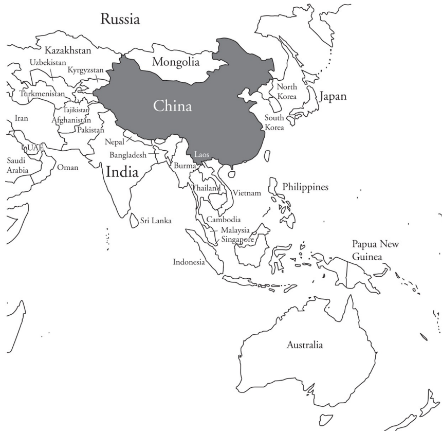
Map 1. China and the Surrounding Region.