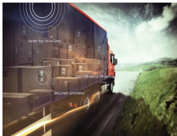
Figure 3. Systems of system.

What if we instead choose to fold in point solutions and targeted capabilities