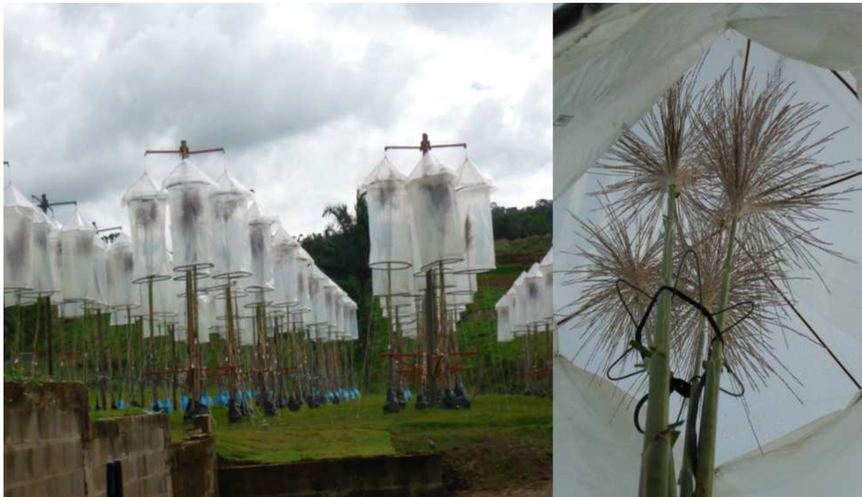
Fig. 2. Sugarcane crossing being carried out under lanterns .

value of its corresponding family (Falconer & Mackay, 1996). Family selection is only more efficient than individual selection when the heritability based on family means is higher than the heritability of the individual plants. According to McRae et al. (1993) and to Cox et al. (1996), association of family selection with individual selection is more efficient than selection based only on families for sugarcane. Cox & Hogarth (1993) stated that family selection with repetition of each clone, followed by individual selection within the best family is the most efficient way to select sugarcane.