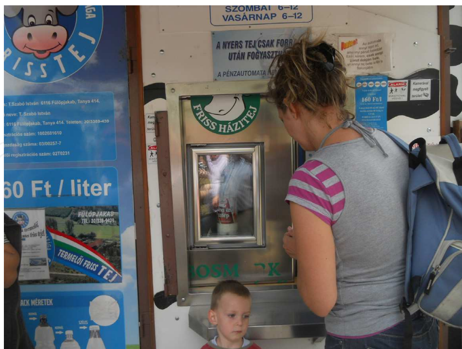
Picture 7. 30-40% price advantages can be reached by using an automatic milk dispenser in the town.

The website represents 95 farmers with 129 products. Most of the farmers joining the programme are leaders in ecological production. Some of the farmers sell fresh vegetables and fruits, others offer prepared products such as marmalade, dried fruits, etc. The program was designed to increase rural tourism, because these activities can serve as complements to one another. On this particular market both products and leisure services are supplied. (Picture: 7.)