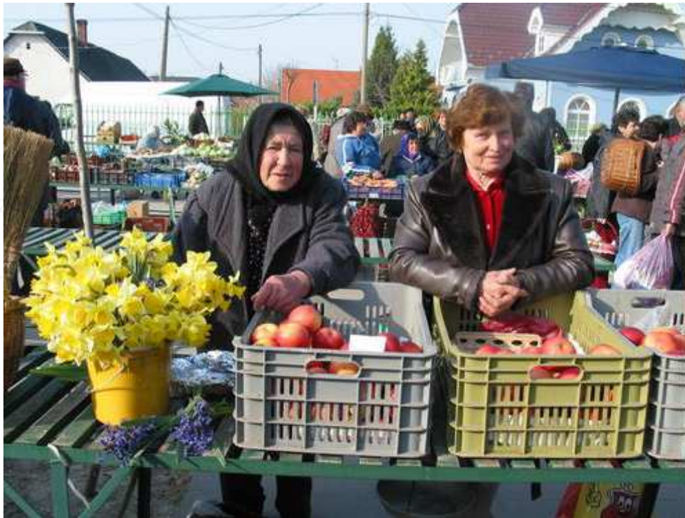
Picture 1. In a traditional village market two generations are selling their own fresh produce and flowers together.

opportunity for farmers to increase their share of the consumer price and to cut some mediators from the distribution chain for these products. In summary, direct sales is a distribution or commercial activity made by local farmers who utilise communication skills that make the purchasing experience of the consumers enjoyable and memorable.