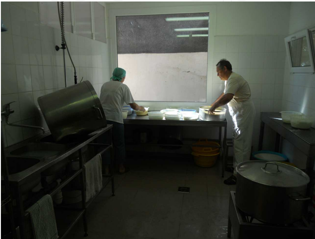
Picture 9. A goat cheese processing unit on a farm is strictly regulated and must maintain hygienic conditions in accordance with high standards.

Despite the fact that agricultural producers do not have the appropriate facilities for retail or processing of foodstuffs, they are obliged to respect the basic rules related to food-sale. (Picture:9.) For instance, if the producer sells the basic product (poultry, rabbit meat) to a local retailer or catering facility, the producer should give the certified copy of the official veterinary document to his business counterpart. In the case of packed goods, the so-called small producer ID, or in the case of honey, the producer ID should be indicated.