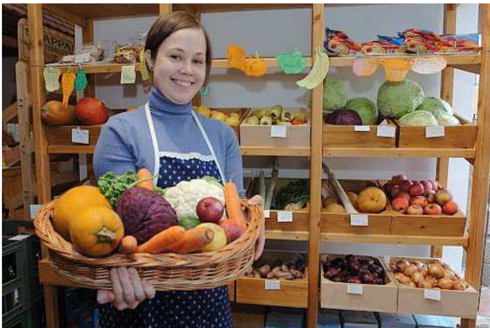
Picture 3. A young organic agricultural producer showing and selling her own products in her shop on the farm

When talking about direct sales, it means that farmers sell their products directly to customers. There are more options: (i) sale in their own shop of farm, (ii) through a catalogue and (iii) delivery directly to restaurants and shops.