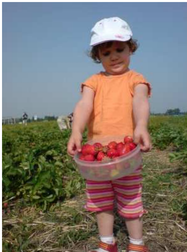
Picture 6. When the buyers pick and transport the fruits themselves, children can actively participate and have their first food selection experience.