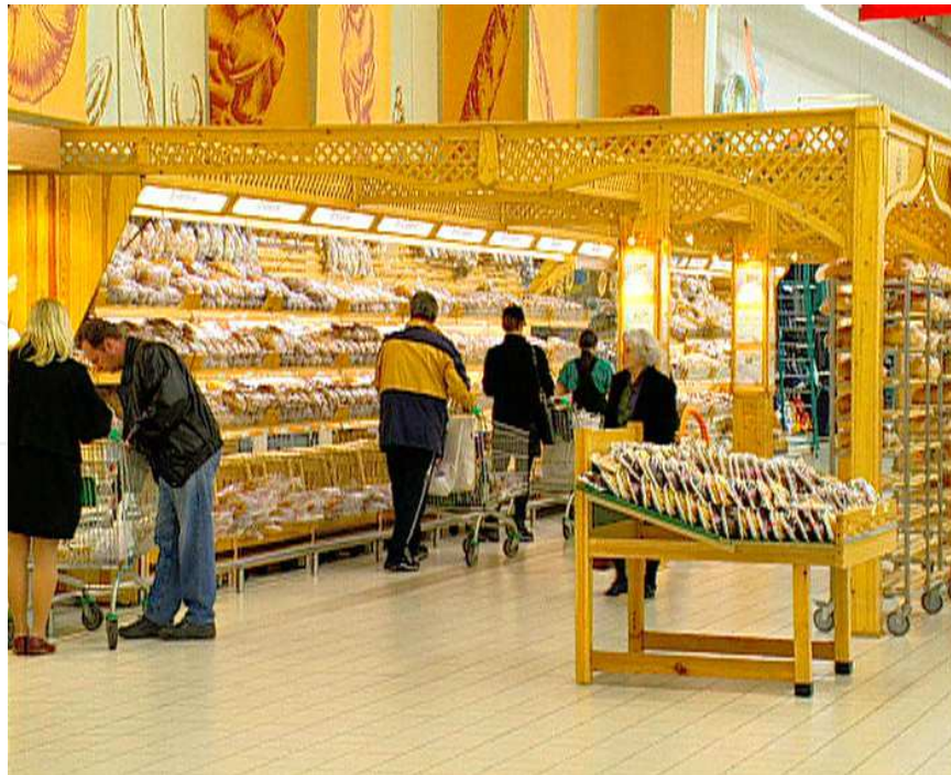
Picture 5. Shopping in hypermarkets is very common in the larger towns. Consumers like to shop twice a month, buying large quantities from the large assortment of choices available.