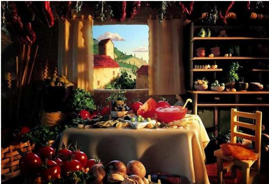
Picture 4. In many cases, farmers have created their own small retail shops for receiving buyers and presenting local products according to the seasons.

Advisers are also helping farmers select the right sales channels to diversify their marketing activities. Until now, we have little credible statistical data on the direct sale of farmers' own produced and processed products. The rural development programs can provide a lot of assistance to help farmers' develop strategies for direct sales. However, specialized advisers are needed to provide farmers with continuing professional education so they can implement the strict food safety regulations and controls.