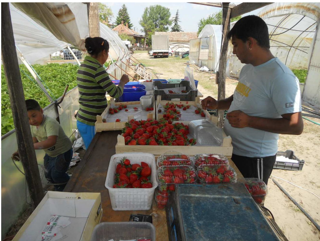
Picture 12. Grading and packaging at the farm is very important and requires the help of all members of the family.