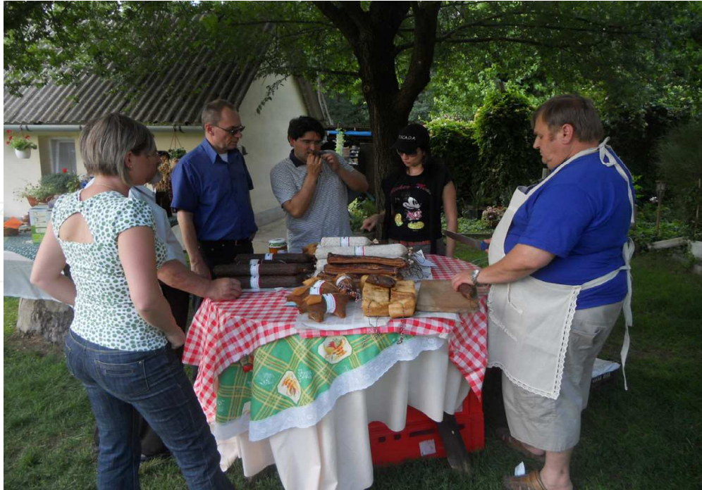
Picture 10. 4-5 farmers work together at a common market on a farm, where once a week they sell their products to regular buyers and tourist as well. The number of buyers can reach 80-100 persons.

In any rural development programme there will be a clear need to coordinate the upgrading of rural markets at farm level with that of associated infrastructure and services if the maximum benefits to agricultural production are to be obtained. This may include upgrading extension services and the improvement of feeder and access roads as well. It should also be noted that directly serving direct marketing at farm's levels may also be critical links in the transport system.