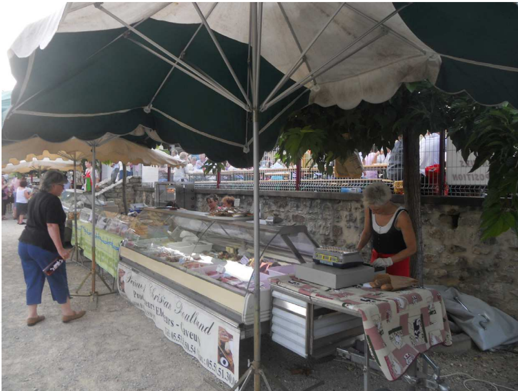
Picture 8. In a French village market tourists are the main clients during the Summer season. The the local government supports the functioning of the market.

It is also important to mention the new direct-from-farm on-line food sale networks, that are already running in many EU countries. This is part of the popular rural tourism, where the customer can get to know the conditions of food production, and meet the producer in person. (Picture: 8.)