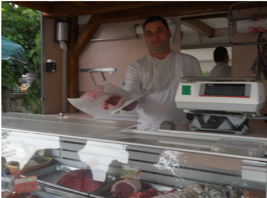
Picture 11. Meat products must be refrigerated and kept in accordance with the hygienic standards. Mobile butcher trucks or trailers are one solution.