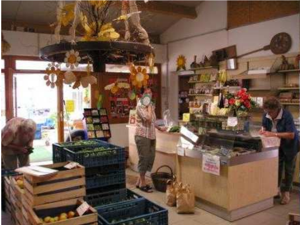
Picture 2. Several farmers cooperatively built a local shop for selling fresh and processed food products.