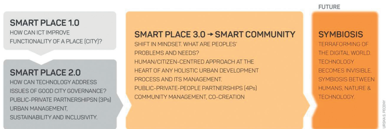
Figure 1. From smart place to smart community.

This new way of communication around smart development is fruit of understanding of the development by stepping aside and avoids the discussion about the right smart expression of the field. We rather try to understand the essentials of the evolution toward smart community and possible further development. We tried to demonstrate this point of view with the help of Figure 1 .