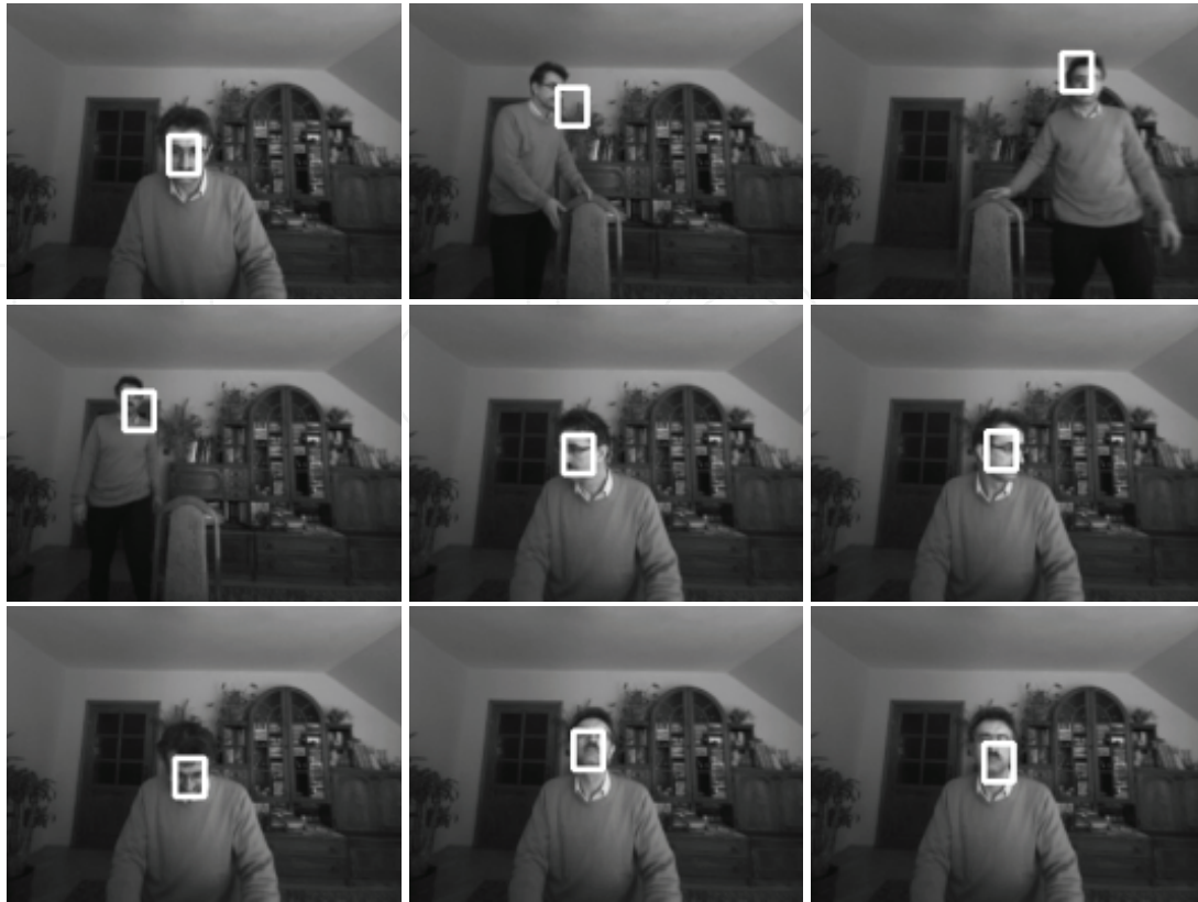
Fig. 6. Face tracking using multi-part object representation in case of occlusions. Frames #1, #15, #25, #45, #46, #48, #55, #65, #70 (from left to right and from top to bottom)