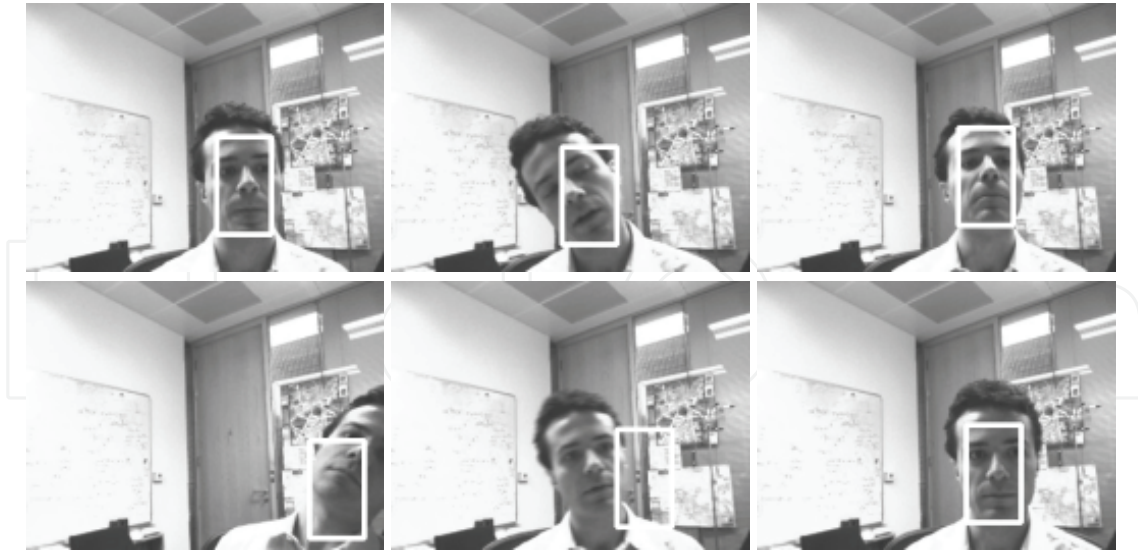
Fig. 8. Face tracking using multi-part representation. Frames #1, #51, #86, #112, #126, #200

experiments demonstrated that even very simple combined algorithm based on the distance between the locations of windows, which have been determined via the employed trackers, leads to considerable improvement of tracking, see Fig. 9 and 10. As we already mentioned in the previous Section, in our combined tracker the adaptive appearance models are learned on-line using only foreground pixels, owing to the estimates determined by the complementary tracker. The information about distance between the locations of windows allows us to detect such pixels easily. What more, given such information we can accommodate the histograms of the object parts, which likely belong to the tracked object. In consequence, the drift of the part-based tracker is smaller. This in turn allows us to accommodate the histograms with rather lower risk that they will be updated via non-object pixels.