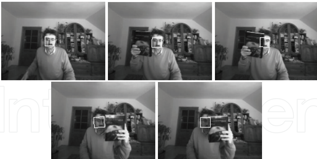
Fig. 10. Tracking of the face undergoing occlusion using combined algorithm. Frames #1, #15, #25, #45, #55

The distance map provided by stereovision system offers great possibilities to construct robust algorithms for human-machine interaction. The proposed algorithms for adaptation and unsupervised learning were tested in real home/laboratory scenarios, and acknowledged great ability to deal with varying illumination conditions as well as complex background.