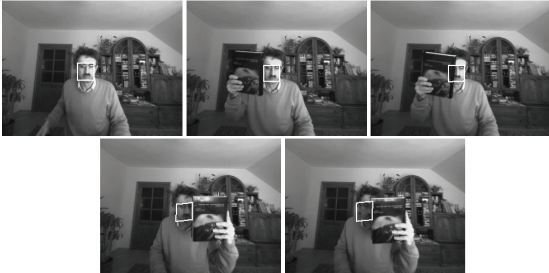
Fig. 4. Face undergoing tracking via particle filter built on adaptive appearance models. Frames #1, #15, #25, #45, #55 (from left to right and from top to bottom)