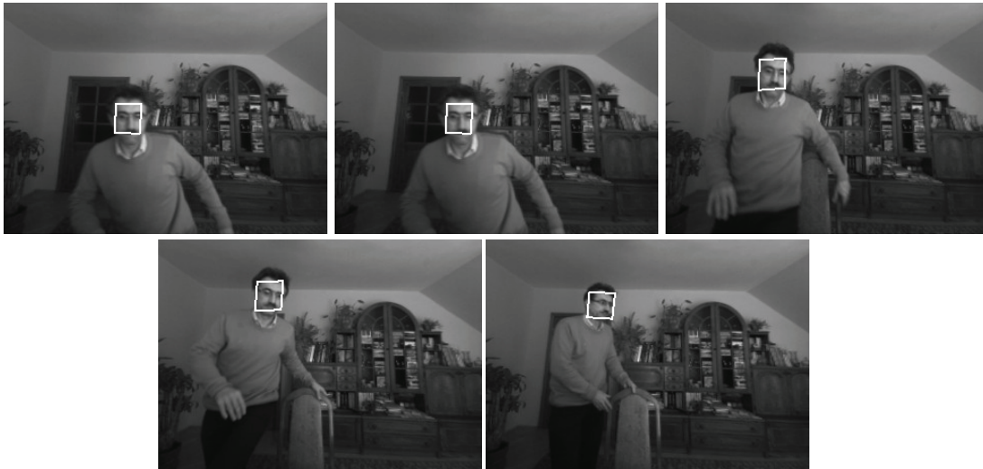
Fig. 3. Face tracking using particle filter built on adaptive appearance models. Frames #1, #20, #25, #30, #35 (from left to right and from top to bottom)

Figure 3. shows tracking the face of a person on images acquired by a camera mounted on the computer monitor. The experiments have been done in a typical home environment. The camera was located in front of wooden doors or furniture. In such a scenario a typical color based tracker can have severe difficulties in following the face because the skin color form clusters, which overlap with colors of pixels belonging to wood. In the depicted images we can see that the jitter of the tracking window is relatively low. However, this gray-level image based tracker failed in frame #36.