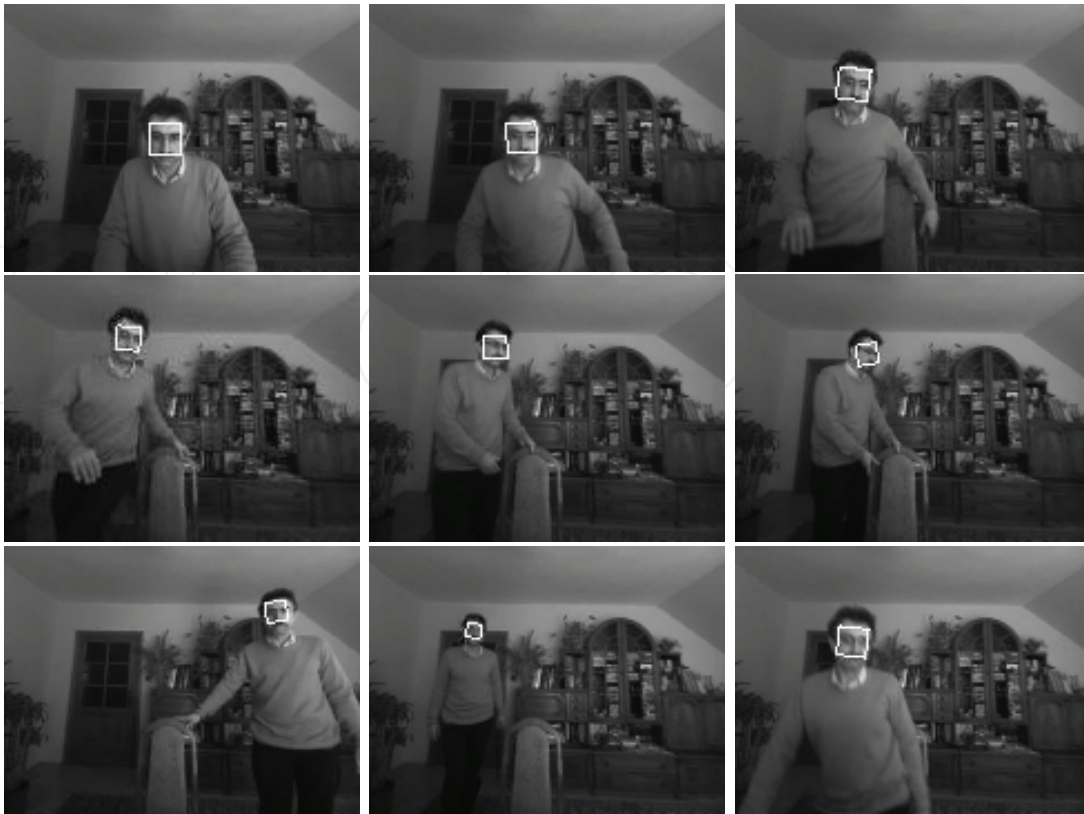
Fig. 9. Face tracking via combined algorithm. Frames #1, #20, #25, #30, #35, #40 #59, #85, #104