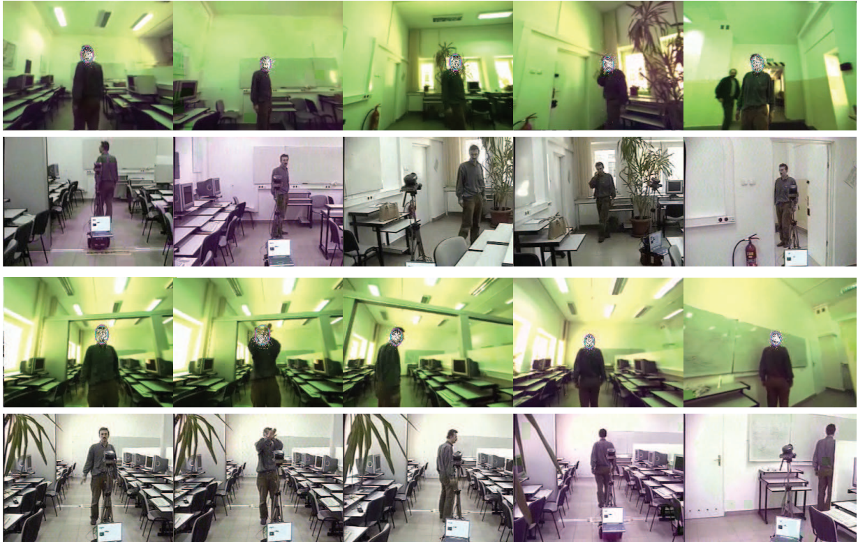
Fig. 2. Person following with a mobile robot. In 1-st and 3-rd row some images from on-board camera are depicted, whereas in 2-nd and 4-th row the corresponding images from an external camera are presented

The tracker runs with 400 particles at frame rates of 13-14 Hz. The face detector can localize human faces in about 0.1 s. The system processes about 6 frames per second when the information about detected faces is used to generate the proposal distribution for the particle filter. The recognition of single face takes about 0.01 s. These times allow the robot to follow the person moving with a walking speed.