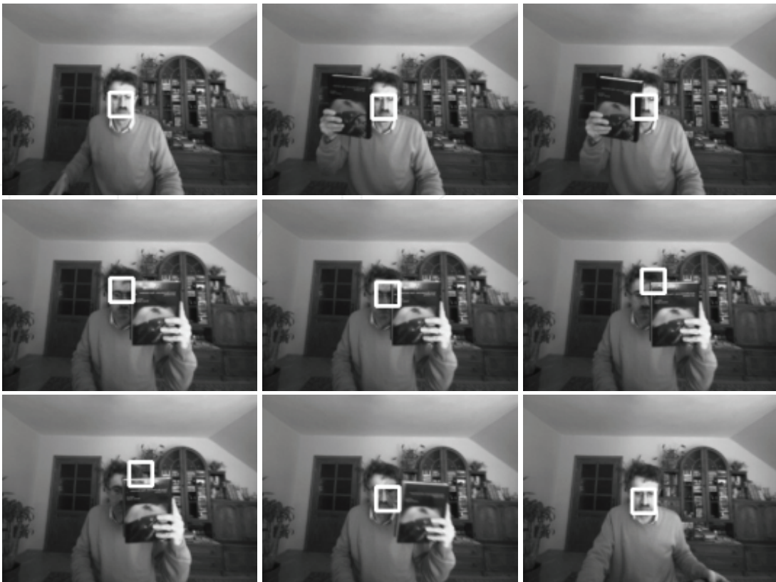
Fig. 7. Face tracking using multi-part object representation in case of occlusions.