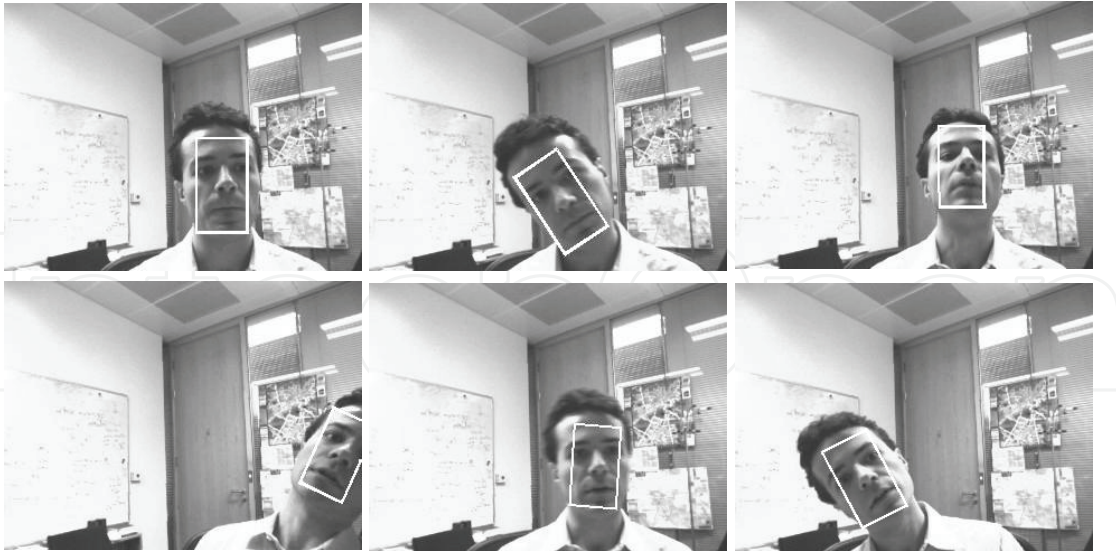
Fig. 11. Face tracking using combined algorithm. Frames #1, #51, #86, #112, #126, #135