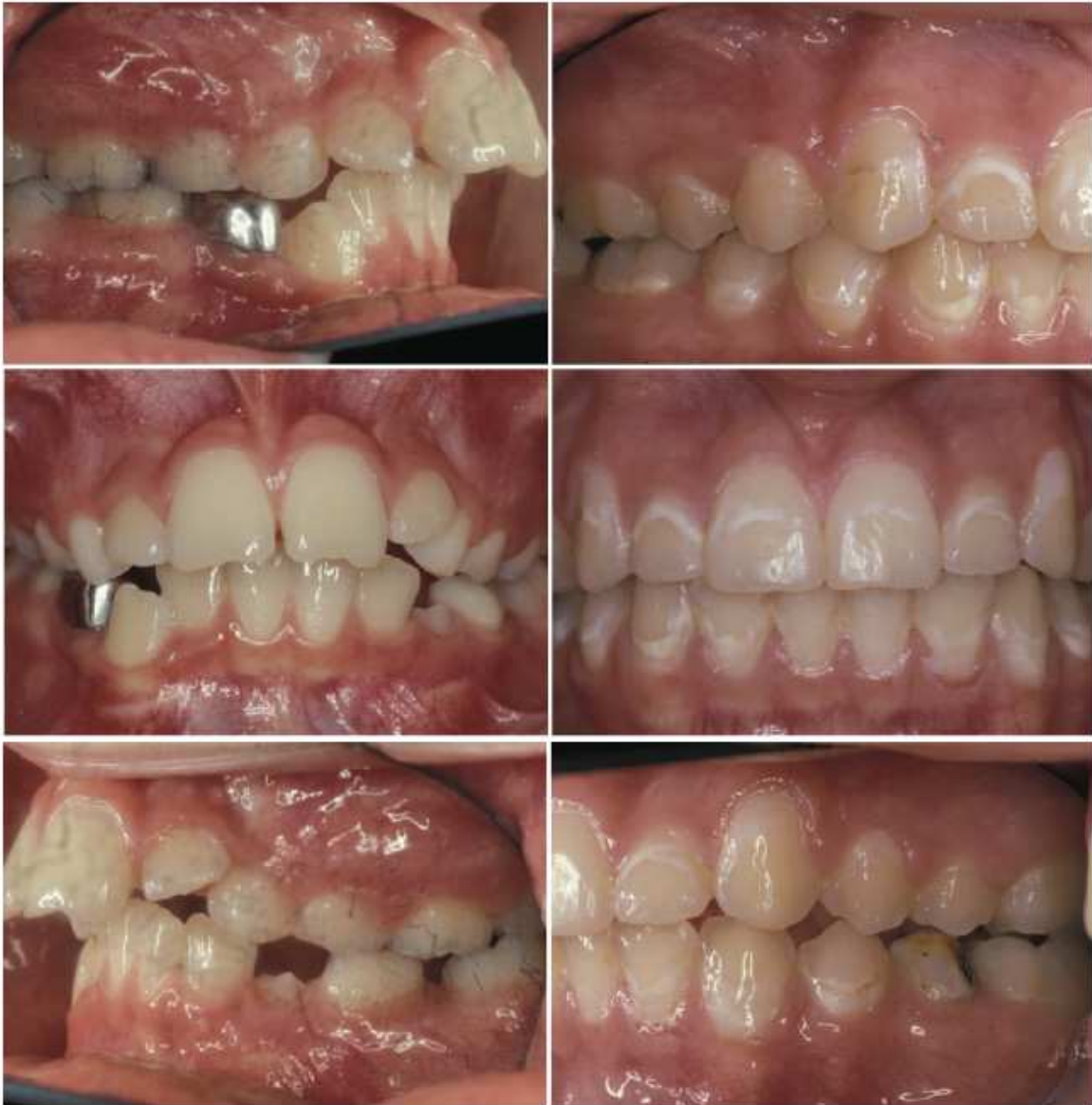
Fig. 2. Tooth labial surfaces were examined and scored from left first molar to right first molar, maxilla and mandible, before and after orthodontic treatment.

Images were evaluated by trained investigators using a scoring system specifically adapted for use with photographed images ( International Caries Detection and Assessment System II ; Ismail, 2005). Visible labial surfaces examined included maxillary and mandibular central and lateral incisors, canines, first and second premolars, and first molars. The evaluators scored each visible labial tooth surface before and after orthodontic treatment. The scores were combined to determine the labial caries incidence for each patient. Teeth were examined and scored from first molar to first molar, maxilla and mandible (Fig. 2).