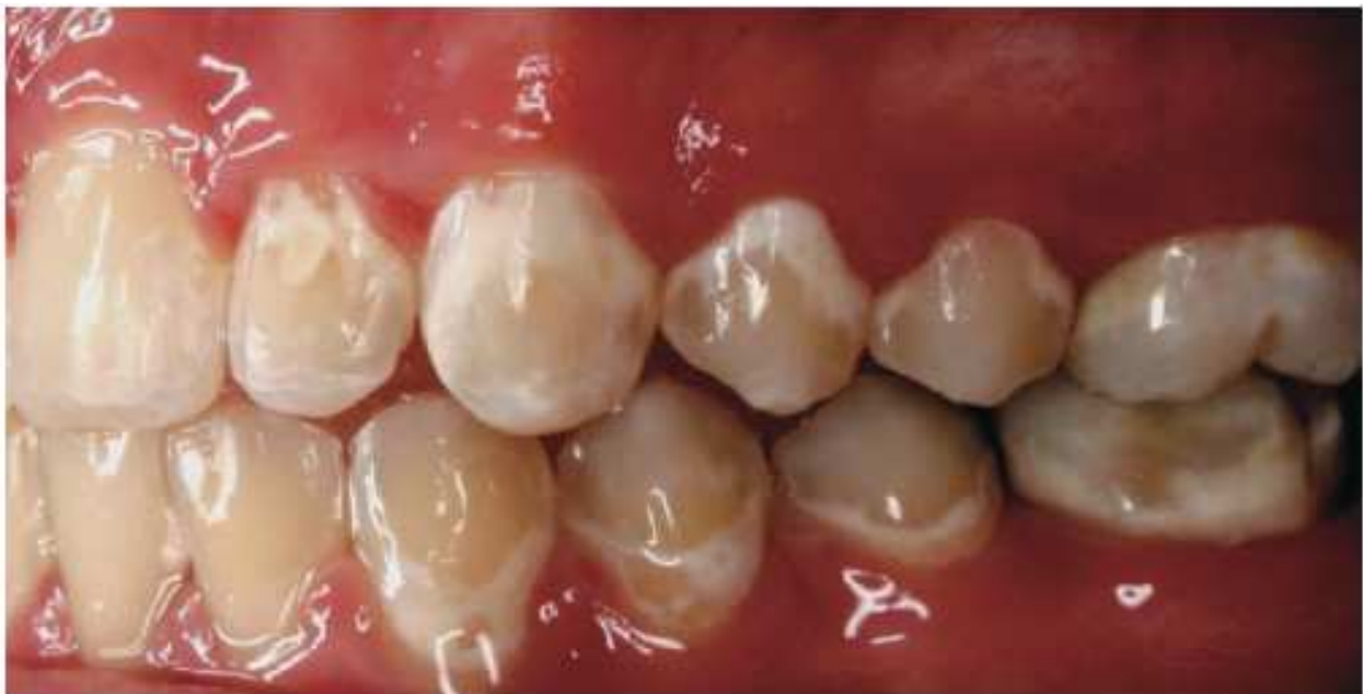
Fig. 1. Incipient caries lesions (white spots) develop around brackets and bands due to poor oral hygiene

One of the most common negative side effects of orthodontic treatment with fixed appliances is the development of incipient caries lesions around brackets and bands, particularly in cases with poor oral hygiene (Fig. 1). Caries lesions typically form around the bracket interface, usually near the gingival margin (Gorelick et al. , 1982). Certain bacterial groups such as mutans streptococci and lactobacilli ferment sugars to create an acidic environment that over time might lead to the development of dental caries. Since orthodontic appliances make plaque removal more difficult, patients are more susceptible to carious lesions. The irregular surfaces of brackets, bands, wires, and other attachments also limit naturally occurring self-cleaning mechanisms, such as movement of the oral musculature and saliva (Rosenbloom and Tinanoff, 1991).