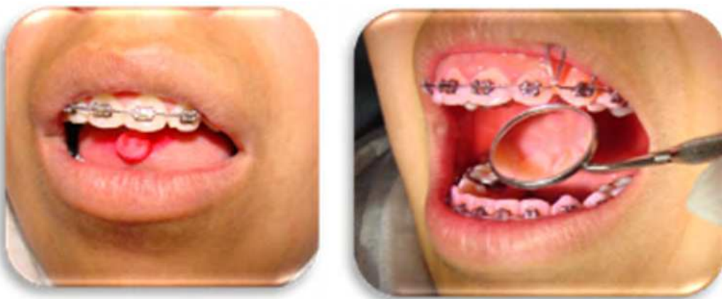
Fig. 2. Plaque control record.

According to O'Leary index, plaque is disclosed with a chewable tablet and its amount estimated. To determine an individual's score, the clinician multiplies the number of surfaces with plaque by 100, and divides that by the number of tooth surfaces examined. (WHO, 2011a) (Fig. 2).