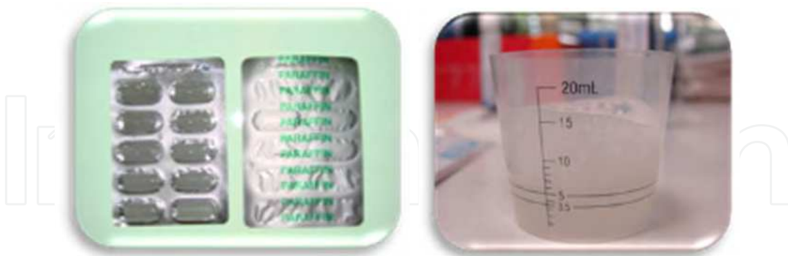
Fig. 4. Stimulated salivary flow.

glands, thyroid insufficiency, Sjögren's syndrome or medicaments (neuroleptics, antidepressants and antihypertensives) (Harris & García-Godoy, 2001) (Fig. 4)