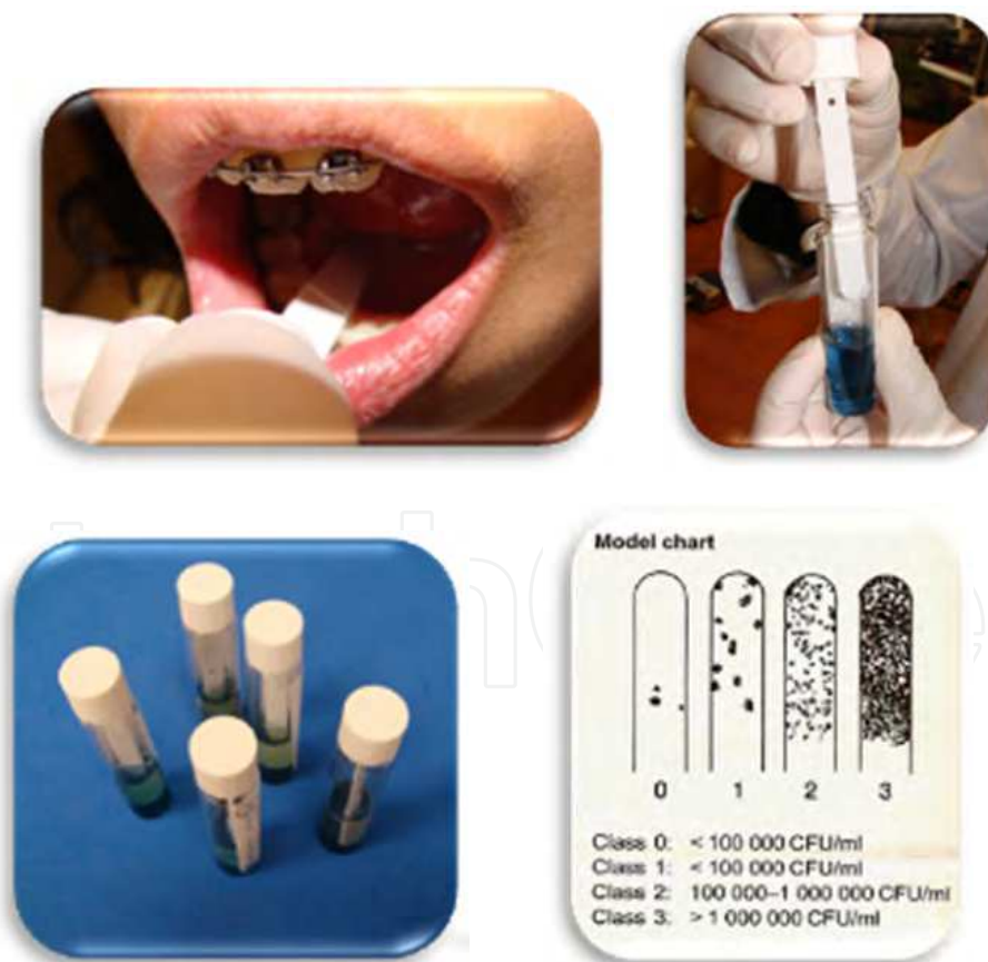
Fig. 8. Specimen collection, and model chart.

The bacitracin disc may be placed in the selective culture Dentocult® SM 2 ; 15 minutes before sampling. Let the patient chew a paraffin pellet for 1 minute. This stimulates the secretion of saliva and transfers mutans streptococci from tooth surfaces into the saliva. Press the rough surface of the strip against the saliva remaining on the patient's tongue (Fig. 8).