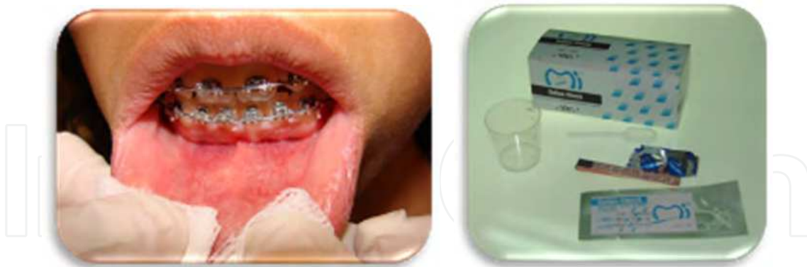
Fig. 3. Unstimulated saliva flow measured by Kit Saliva Check.