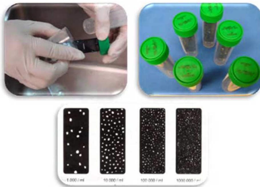
Fig. 10. Collect the lactobacillus sample, manufactured chart.

Prognosis of caries becomes more effective when the lactobacilli and streptococci tests are combined.