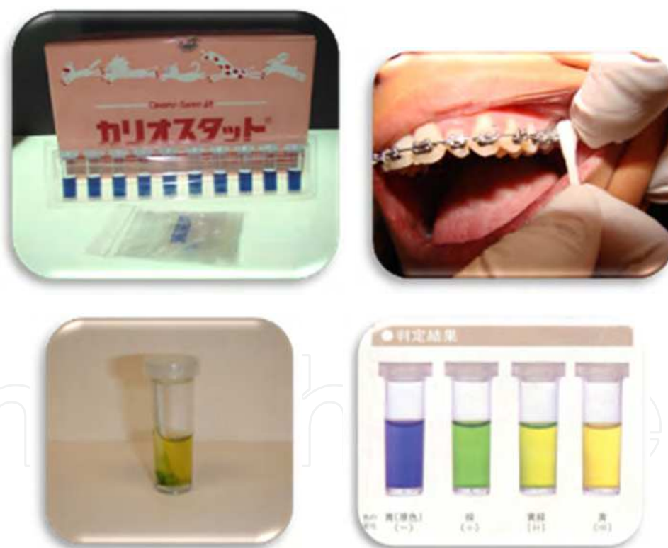
Fig. 11. Caries activity test Cariostat®.

Blue negative value = pH 5.8-7.2 Green one positive value = pH 5.4 \pm 0.3 Yellow greenish two positives value = pH 4.8 \pm 0.3 Yellow three positives value = pH < 4.4 (Fig. 11).