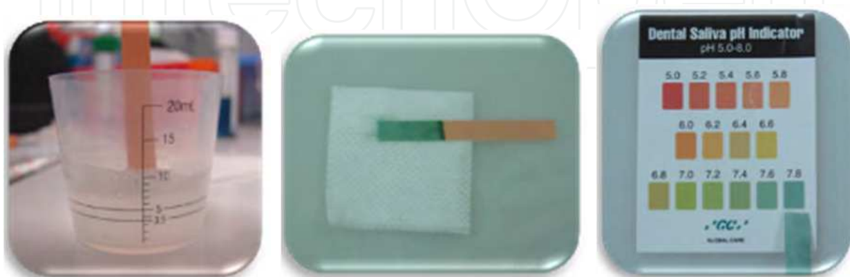
Fig. 5. The reactive strip compared with the manufactured chart.

The concept of critical pH is applicable only to solutions that are in contact with a particular mineral, such as enamel. Saliva and plaque fluid, for instance, are normally supersaturated with respect to tooth enamel because the pH is higher than the critical pH, so our teeth do not dissolve in our saliva or under plaque (Featherstone, 2000; Dawes, 2003) (Fig. 5).