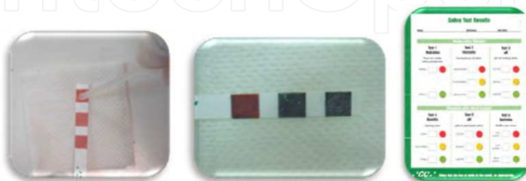
Fig. 6. Buffering capacity (Saliva Check ® ).