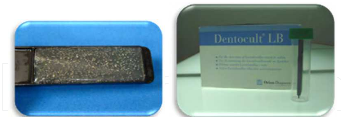
Fig. 9. Dentocult LB® test.

The standard method for determining the presence of lactobacilli is through the selective medium Rogosa SL agar. An alternative was established by Larmas in 1975 with the introduction of the test Dentocult LB®. The advantage is that it can be used in the dental office and the results can be shown to make the patient aware of the presence of lactobacilli in the mouth (Fig. 9).