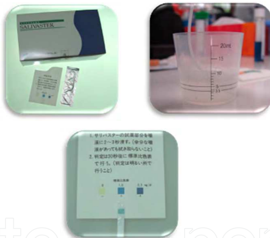
Fig. 12. Initial indicator of periodontal disease through occult blood in saliva (Salivaster ® )

The Salivaster ® is a colorimetric test based on a catalytic reaction of hemoglobin in saliva inducing the formation of different colors ranging from yellow to dark green. The principle of the color reaction is similar to the test for blood in urine, but was developed for the particular viscosity of saliva (Fig. 12).