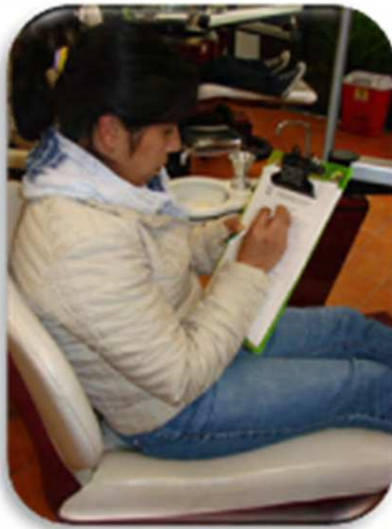
Fig. 13. Filling the questionnaire dietary and hygiene habits

To know the habits of the patient is recommended to apply a questionnaire which included a series of questions regarding daily brushing and eating habits, focusing on behavioral risk factors for dental disease. (Fig. 13).