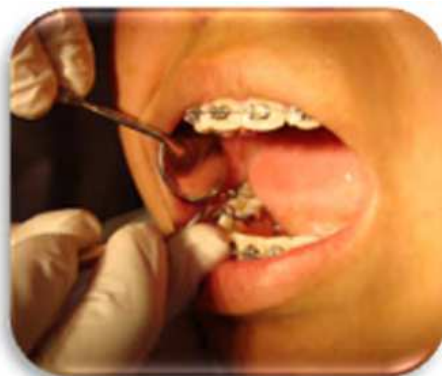
Fig. 1. Obtained DMFS index.