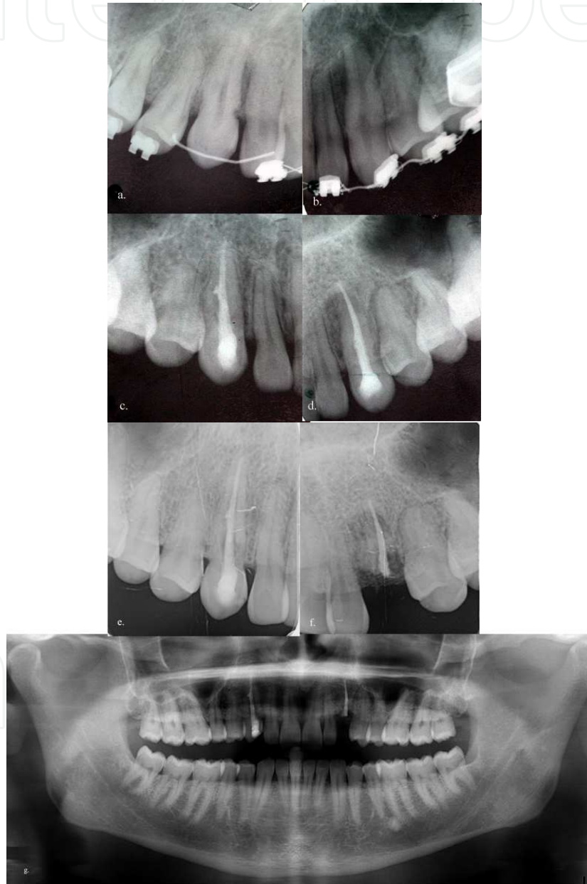
Figure 1. Bilateral impacted canines were treated with autotransplantation in a 22 year old adult patient. A wait and see strategy was followed and canal therapy was applied after seven months from autotransplantation as external root resorption was detected. 10 years after treatment the patient came with the left canine broken due to external root resorption, however no difference was observed in the contralateral canine.

The progress of canine eruption should be monitored with roentgenograms, using reference points such as an adjacent tooth or the arch wire. If the tooth fails to erupt, removal of any cicatricial tissue surrounding the crown is recommended. The main disadvantages of this approach are the spontaneous but slow canine eruption, the increased treatment time, and the inability to influence the path of eruption and the risk of ankylosing [21].