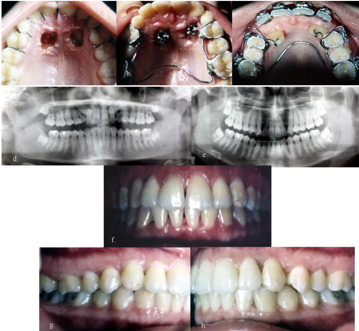
Figure 3. Bilateral palatally impacted maxillary canines were uncovered by open surgical technique, orthodontic traction was performed by ballista springs. Alignment of bilateral maxillary canines lasted 4,5 years.

on the impacted tooth. One week later postoperatively the pack is removed and an attachment is bonded with subsequent traction using a fixed appliance. There is some evidence that the periodontal status may be compromised [107]. (Figure 3)