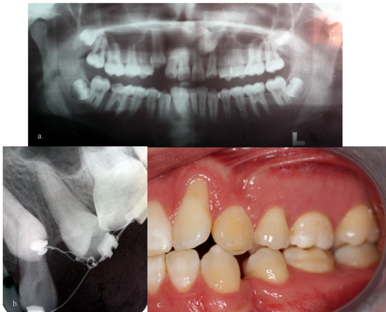
Figure 5. A buccally directed traction of a palatally impacted maxillary canine resulted in the buccal movement of the adjacent lateral root due to the close proximity and gingival recession was observed 10 years after treatment.

used as a source of anchorage. A mandibular fixed lingual arch with a vertical hook can be used for this purpose. Elastics are engaged in these vertical hooks and to the attachment on the impacted teeth for the required traction. In addition directional forces can be used by applying elastics. The main disadvantage of mandibular anchorage is the difficulty encountered in controlling the magnitude and direction of the applied forces because of the mobile mandibular arch [115].