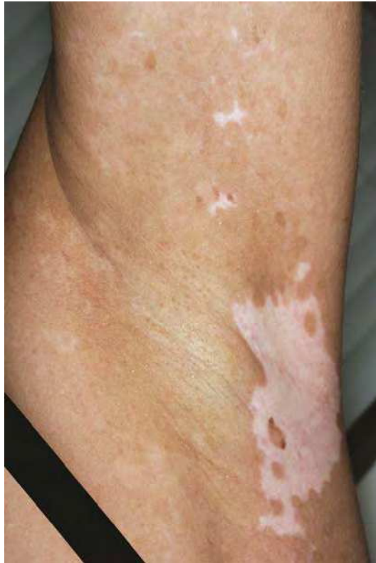
Fig. 6. NB-UVB is an effective treatment modality for vitiligo. Short term adverse effects are primarily related to phototoxicity. Long-term carcinogenic risk may not differ greatly from the general population.

When comparing UVB and PUVA carcinogenic risk, a single PUVA increases risk 7 times more than a single UVB treatment (Lim and Stern, 2005). Even with a history of PUVA therapy, patients who had less than 300 treatments of UVB had no appreciable increase in NMSC risk (Lim and Stern, 2005). Available data on NB-UVB therapy has not consistently identified a significant increase in NMSC when compared to the general population (Table 4). The majority of follow-up data was primarily taken from Caucasian populations, but the same conclusion has been drawn in non-Caucasians with skin types III-V (Jo, Kwon et al., 2010). An increased risk of BCC was noted in two Scottish studies, one with NB-UVB monotherapy, and the other with a history of both NB-UVB and PUVA usage (Stern and Laird, 1994; Man, Crombie et al., 2005). However, the temporal relationship between tumor diagnosis and phototherapy makes a relationship between therapy and cancer unlikely in either study (Stern and Laird, 1994; Man, Crombie et al., 2005). In addition, it is common to use topical pimecrolimus and/or tacrolimus as adjuncts to NB-UVB. Topical pimecrolimus and tacrolimus have not been found to increase risk of NMSC in adults. Therefore, even in combination with NB-UVB, there should be no cumulative carcinogenic effect. Therefore, UVB, in particular NB-UVB, may be the phototherapy option with the least carcinogenic risk in all skin types.