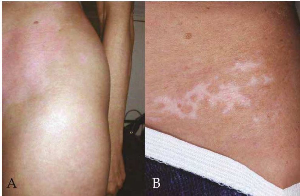
Fig. 4. A. Extensive vitiligo of the lower abdomen and hips. B. Repigmentation of vitiligo patches after 24 months of NB-UVB treatment.

Home UVB therapy may be a valuable and convenient option for select patients. Patient-reported outcomes for home NB-UVB therapy and outpatient NB-UVB therapy revealed that they show similar clinical efficacy and safety profiles (Wind, Kroon et al., 2010). Home NB-UVB is convenient and can be cost-effective in certain situations. However, more reliable long-term follow-up data is needed to further justify home UVB therapy.