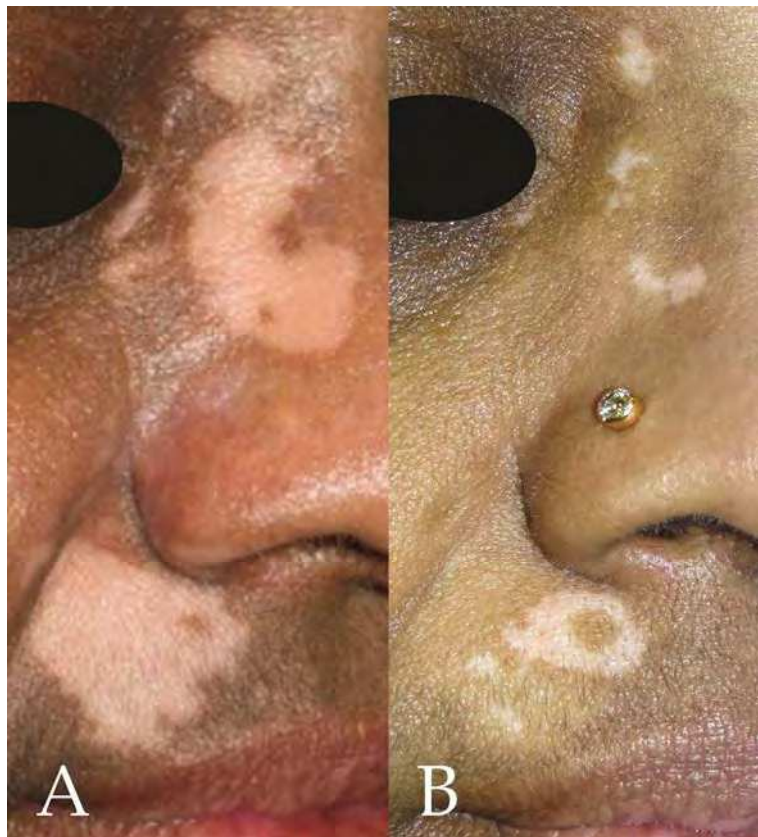
Fig. 3. A patient with facial vitiligo was treated with NB-UVB phototherapy three times weekly. A. The patient prior to initiating treatment. The patient was then started at 200 mJ based on standard protocol for Fitzpatrick skin type III. B. The patient with notable repigmentation after treatment 56 at a dose of 1001 mJ.

NB-UVB for vitiligo is most effective on the face and neck, followed by the trunk, and then upper extremities (Figure 3). Acral regions including the lower extremities, palms, and soles are more resistant to treatment. The reason has yet to be elucidated, but the regional density of hair follicles, which are reservoirs for melanocytes, are thought to play a role (Stinco, Piccirillo et al., 2009). In general, the repigmentation patterns in patients treated with NB-UVB are, in descending order, perifollicular (51.3%), then marginal, diffuse, and combined (Yang, Cho et al., 2010). However, the marginal pattern was observed to be the most common when >75% repigmentation occurred by 12 weeks of treatment (Yang, Cho et al., 2010).