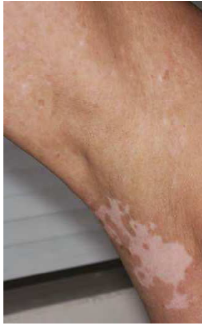
Fig. 5. Amelanotic patches of vitiligo in flexural areas undergoing involution NB-UVB therapy.