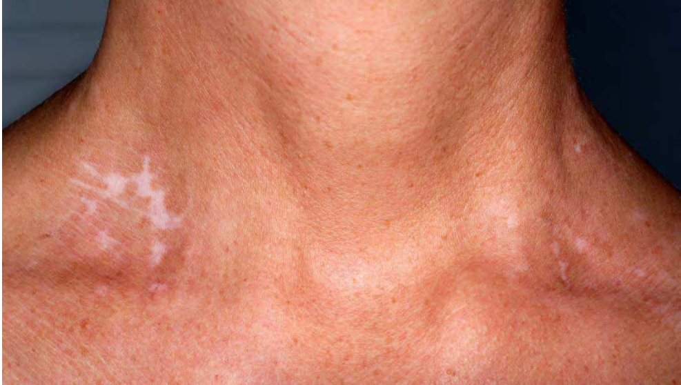
Fig. 2. Near complete repigmentation of vitiligo patches with NB-UVB treatment.