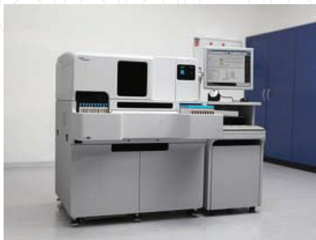
Figure 1. Cs-5100 systems to measure FDP and D-dimer (Sysmex Corporation., Hyogo, Japan).

In our facility, FDP and D-dimer are measured by an immunoturbidimetric method using Cs-2000i and Cs-5100 systems (Sysmex Corporation., Hyogo, Japan; Figure 1 ). It takes about 15–20 minutes to measure FDP and D-dimer with this instrument.