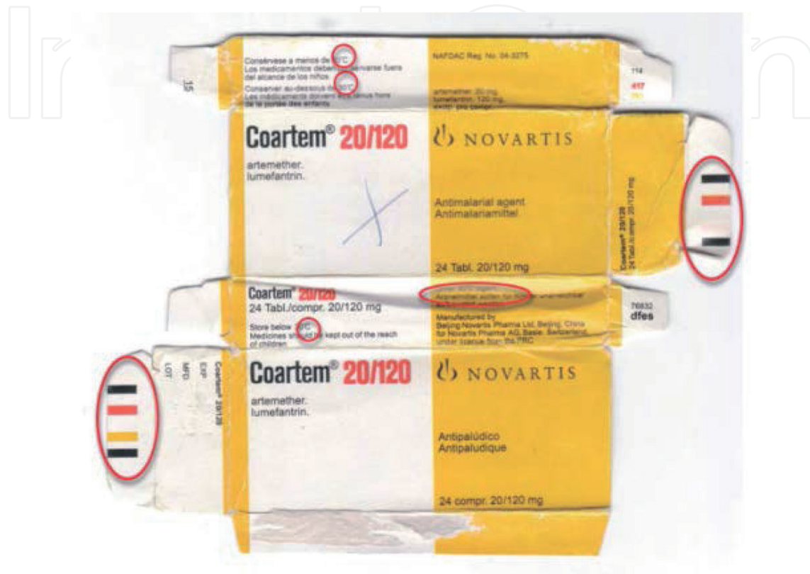
Figure 1. Features differentiating fake and genuine Coartem®.

without professional oversight by pharmacists may also fall prey to international criminal syndicates that may use their operations to add to their consignments other products including counterfeit drugs as explained above [59, 60]. Moreover, the weak capacity in developing countries at customs and the fact that the bribing of officials ensures that any consignment can enter a country facilitates the illicit trade [70].