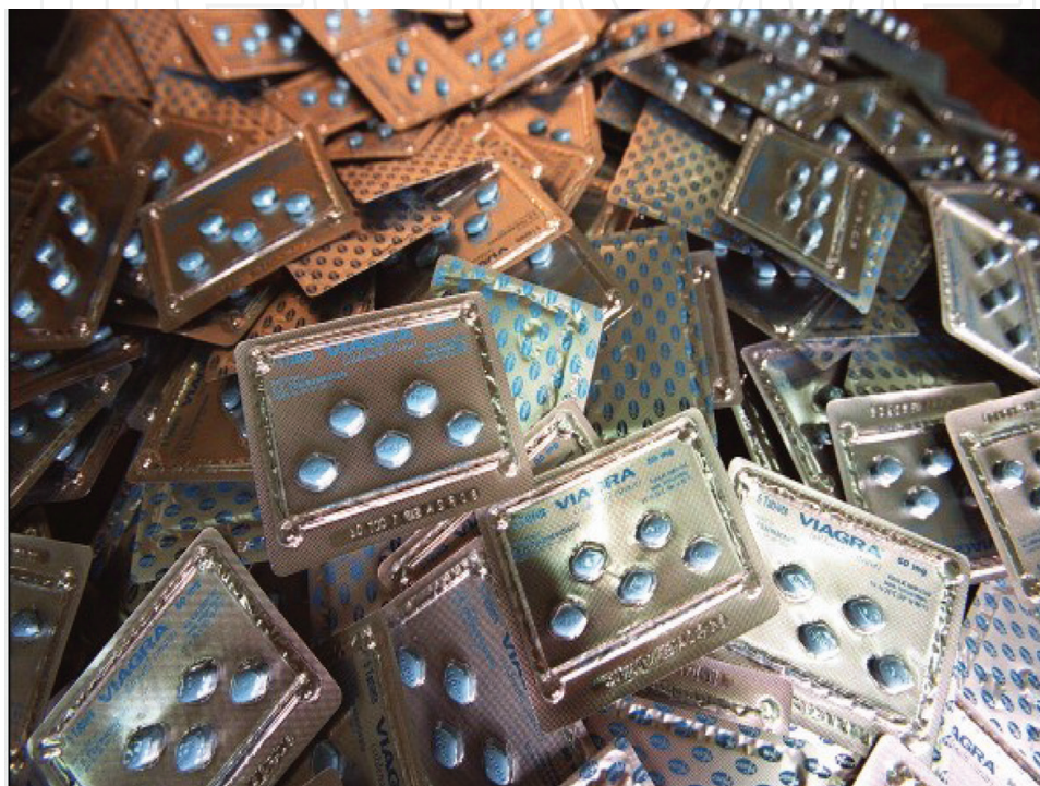
Figure 3. Viagra® bust by South African customs officials worth ZAR 40 million [about 2.8 million USD]

in hospitals pharmacies and other pharmaceutical outlets and thus obtain legitimate products that are subsequently sold to consumers through illegal and unlicensed businesses and outlets. It should be noted that non-professional healthcare workers or support staff members have been and are also a source of stolen products from health facilities. These products end up in the streets to be sold by unlicensed entities and non-professionals including legitimate or illegitimate traditional healers, herbalists, drug dispensers and other small traders [85–89].