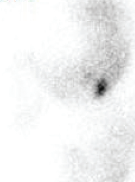
Figure 3. In vivo analysis of the drug-delivery system gastroretentive behavior.

In the other study, aiming to demonstrate the gastroretentive efficacy of high-density tablets, a similar process was used to radiolabel the produced tablets. Again, it was possible to see the in vivo positioning of the pharmaceutical dosage form and confirm that the high-density controlled release strategy is effective for delivering drugs with a narrow upper GI absorption window (see Figure 3 ).