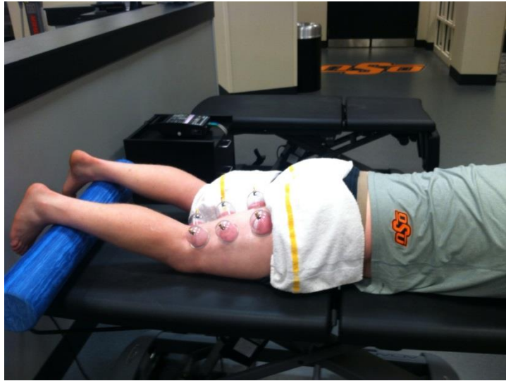
Figure 2: Subject lying relaxed with the cups attached

along the treatment area following a distal to proximal pattern. As soon as the cups were removed post measures for range of motion were taken immediately, then the post measure PFAQ and GROC were also completed.