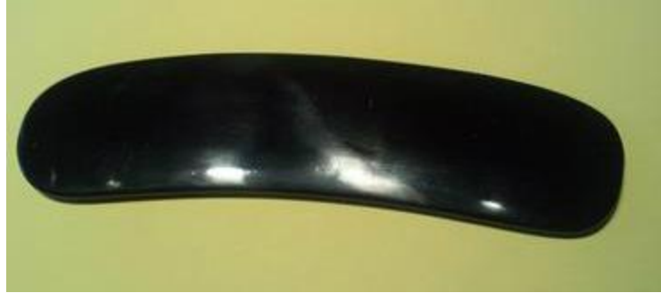
Figure 1: Large Crescent IASTM Tool