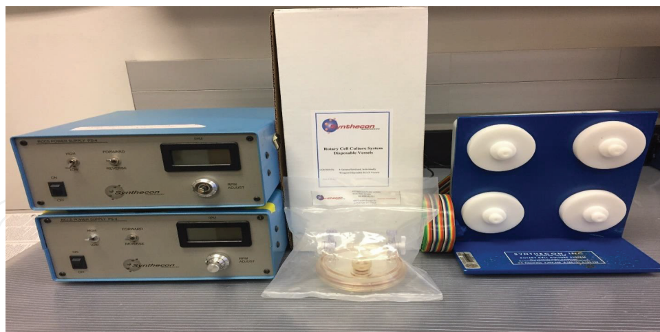
Figure 3. Rotatory cell culture system. The RCCS was originally developed in NASA's Johnson Space Center in order to simulate the microgravity conditions of space. It is structured is based on the principle of clinorotation, which is defined as the nullification of gravity's force by slowing the rotation around one or two axes. NASA's clinostat is a single axis device known as the rotating wall vessel (RWV), the RCCS is the commercial version of this device. The NASA rotating bioreactor simulates microgravity by gently moving the growth medium while growing cells are kept in suspension by a constant "free fall" effect.

In the study of Bradley et al., they investigated how T lymphocytes recognized the antigen presenting cells like the dendritic cells which invokes T cell proliferation driven by interleukin-2 (IL-2) and other cytokines. With this activation these cells are able to function in order to kill invaders and tumors, in retrospect, during spaceflight the production of cytokines is reduced along with reduced proliferations and effector functions, symbolizing the control that gravitational forces have over the immunity function. The researchers then propose that this may be the leading cause for the opportunity for cases of viral reactivation events and opportunistic infections associated with astronauts of numerous missions. In conclusion they found that over exposed culture of T cells in SMG resulted in increased expression of the inhibitory receptor, CTLA-4. Blockade of CTLA-4 interaction with DC ligands resulted in improved T cell IL-2 production [4].